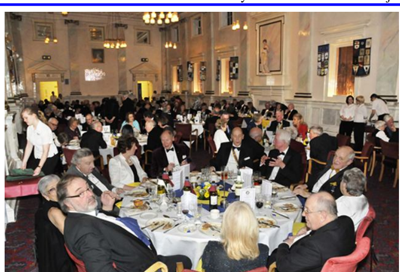
The Club's 89th Charter Dinner in the County Assembly Rooms. Club members and their guest enjoyed roast sirlon of Lincolnshire beef in an evening of fun and great fellowship.

This club has a reputation of being a well run club – we are efficient -but are we effective? The simple definition of efficiency is doing the job right and I am sure we can put a tick in the box. The simple definition of effectiveness is doing the right job. Are we focused on the right things in the 21 st century - are we using modern communications effectively twitter and Facebook are just